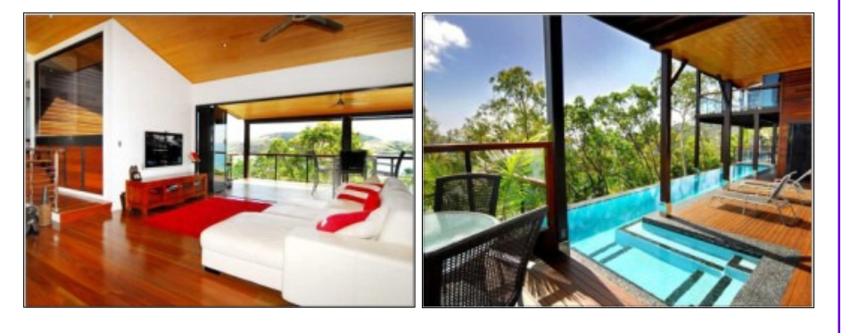
Point Blue - Click here to view the image gallery

Bookings are subject to availability. Phone 1800 645 103 or email <u>kay@tradetravel.com</u>